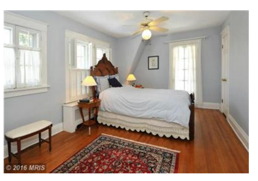
Bed area of Master Bedroom