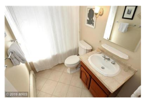
Second Floor Hall Bath