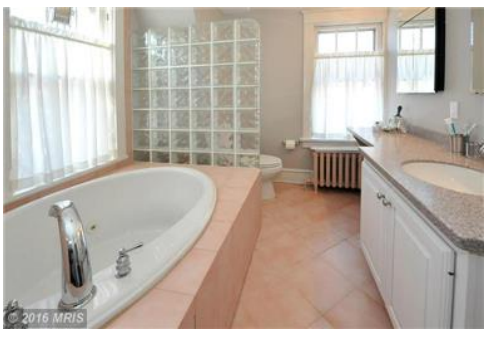
View from the shower of Master Bath