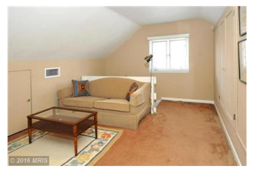
Bedroom #4 Sitting Area