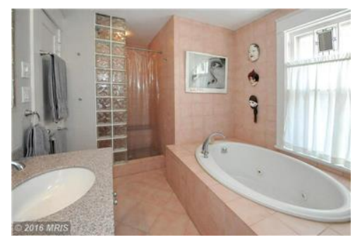
View of tub and separate shower in Master Bath