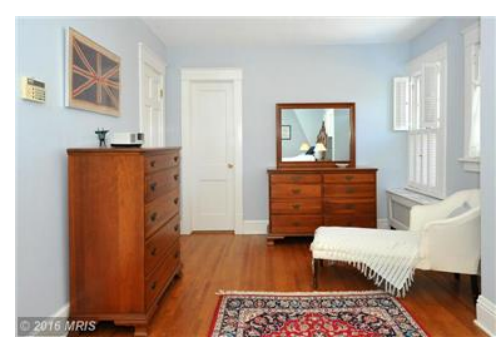
Sitting area of Master Bedroom