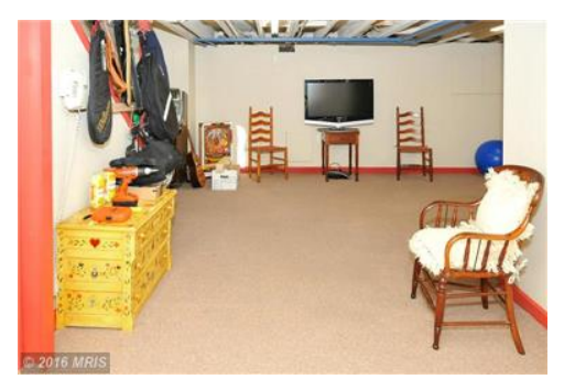
Recreation Room View 2